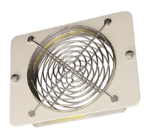
Ionizing Ring For Fans Model P-2063