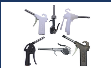
Gun Handle Accessories for the P-2021