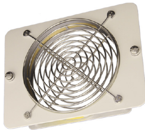
Ionizing Ring For Fans Model P-2063