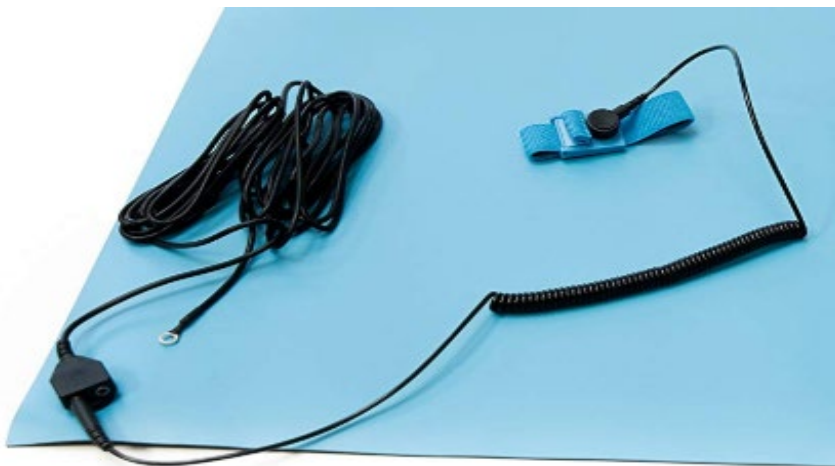
Figure 3: Connected Wire to the ESD Mat (for common grounding) and Wrist Strap