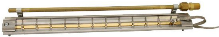
P-2001 with Accessory Air Tube Model 4275